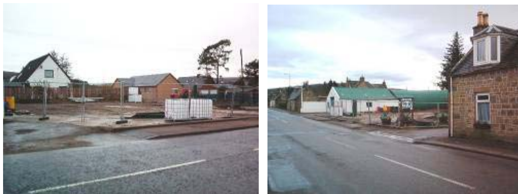
Figs. 2 and 3 : Proposed site as viewed from (a) opposite and (b) from the north