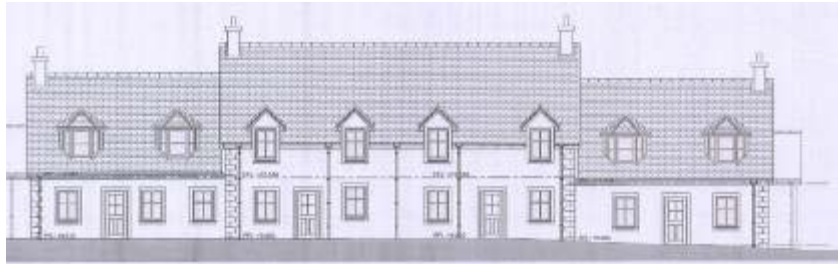
Fig. 4 : Proposed front (street) elevation

The central section includes standard design, flat faced dormer features, partially recessed into the roof space, while more ornate piend dormer windows are proposed on the outer wings, reflecting the features of a number of the older one and half storey residences in the vicinity. A slate roof, 1 incorporating red ridge tiles, is proposed. Off white wet harling is proposed on the majority of the external walls, with smooth cement quoins also being incorporated for detailing on the front elevation. Windows, doors and fascias are proposed to be stained / painted white.