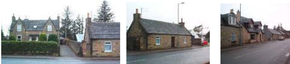
Figs. 7,8 and 9 : existing properties to the south and north of the proposed site