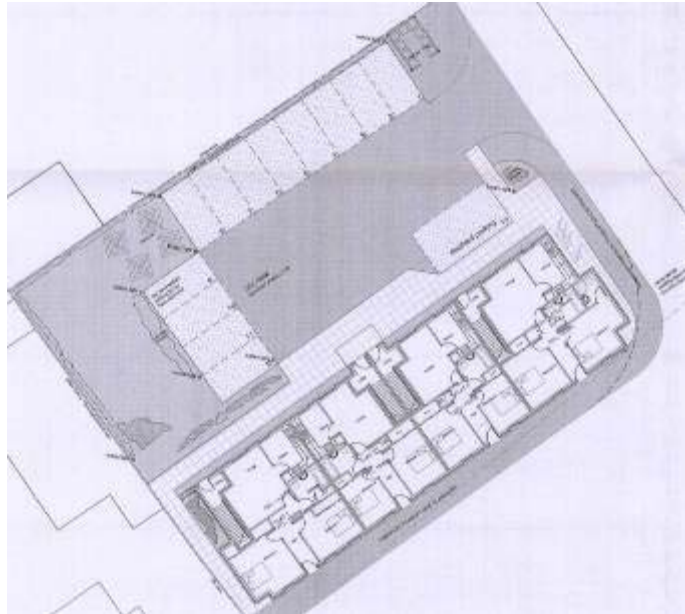
Fig. 5 : Proposed site layout plan